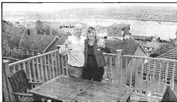
Top that: The Spearman's view of the Medway