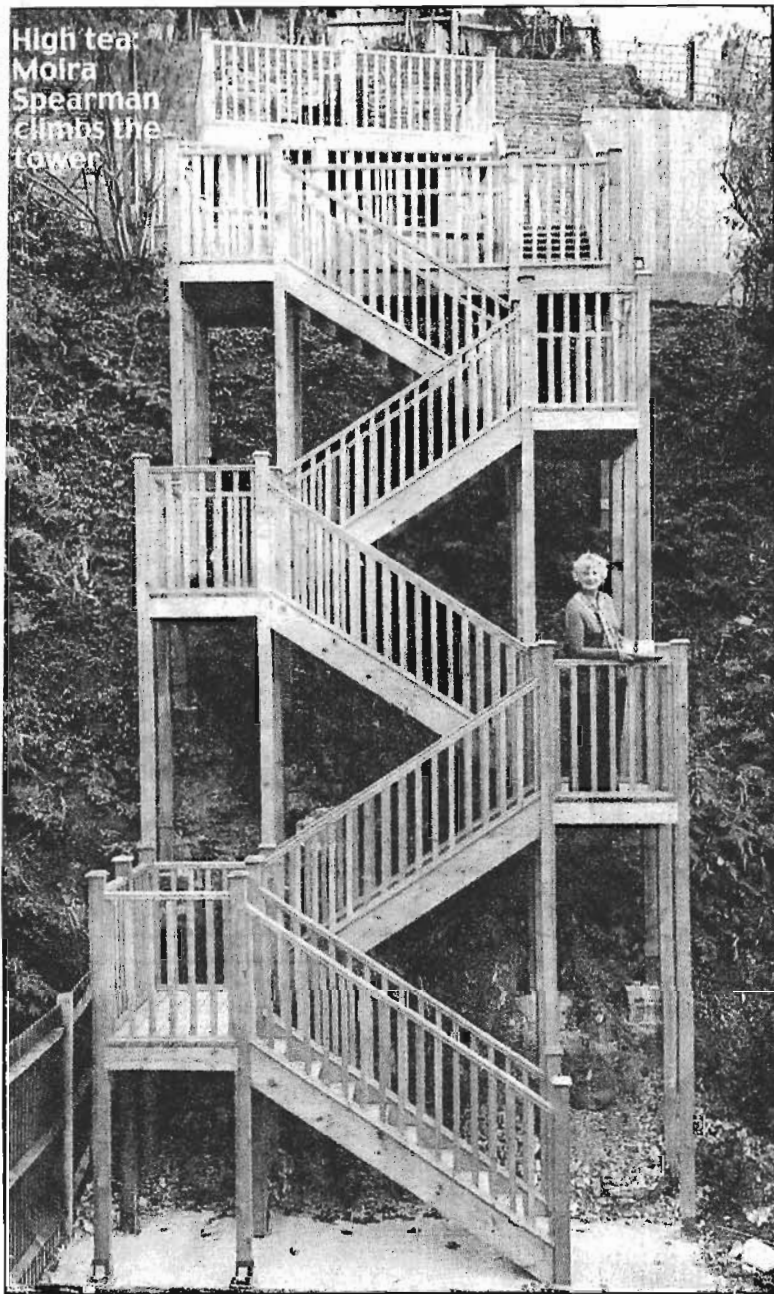
High tea: Moira Spearman climbs the tower